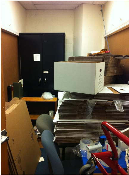
Storage Room "G" Before (left) and After (right)