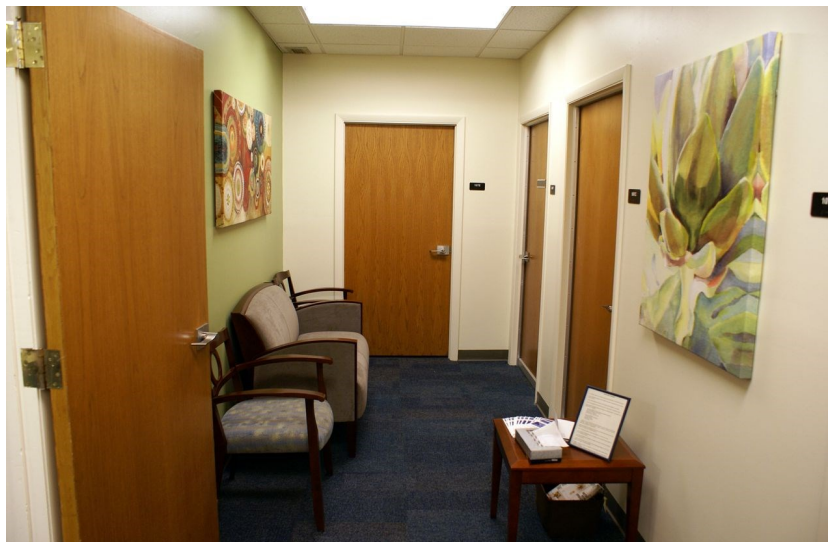
The newly renovated waiting room.