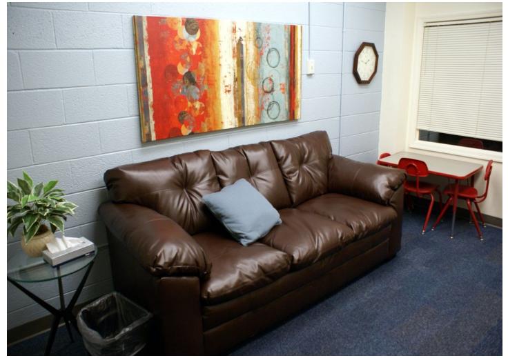
Two of the Therapy rooms Before (on the left) and After (on the right)!