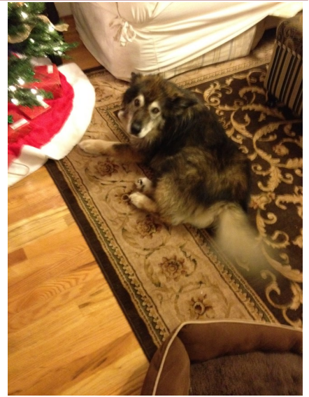
and, her dog Phoebe.