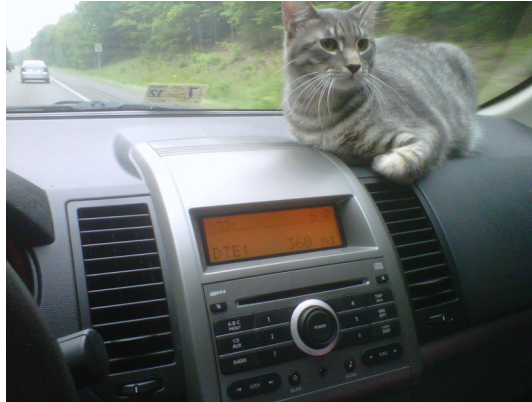
her cat Leeroy Jenkins, . . .