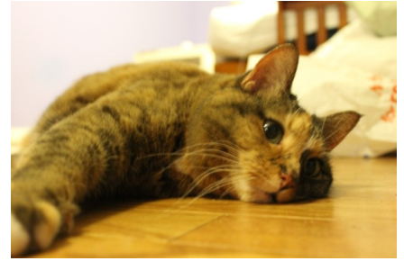
and, her cat Pumpkin.